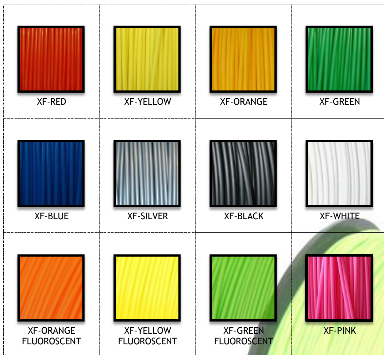
Table 1. XF-ABS filament colors and names